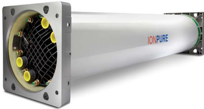
IONPURE® VNX55-EP HIGH FLOW CONTINUOUS ELECTRODEIONIZATION (CEDI) MODULES